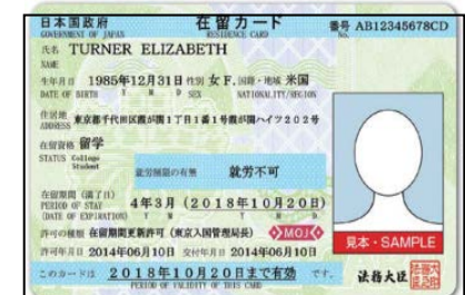
Resident Card Both visa and expiration date must be valid.