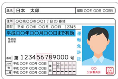
Japanese Driver's License Must have additional document See next page

“Non-Japanese nationals must present passport or Resident card.”