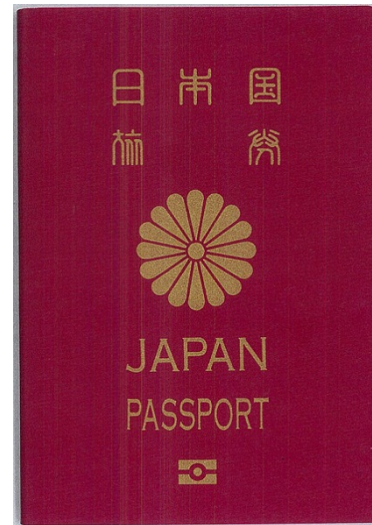
Japan/Foreign Passport Valid visa required for non-Japanese