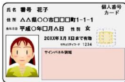
My Number Card (Kojin Bango Card) Pictured Form Only