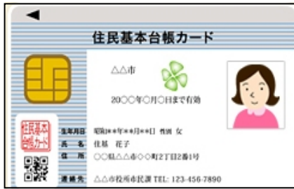
Basic Resident Registration Card (Jumin Kihon Daicho Card) Pictured Form Only

Must present one of the below listed official IDs: